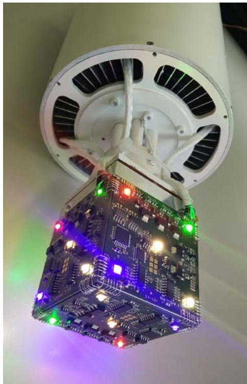
Figure 2 – Picture of the bare Multiple Transfer Standard equipped with different coloured, warm white and cold white LEDs

To show in case of sphere measurements whether or not a test setup is able to measure the luminous flux of a variety of different LED-based sources correctly and with the expected uncertainties, the MTS is equipped with sets of calibrated coloured and white LEDs (see Fig. 2).